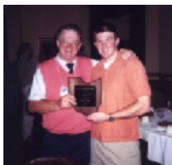
Figure 2: Teaching award