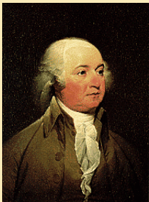
John Adams 1797-1801

eCards: U.S. Presidents AcroTeX eEducation Bundle