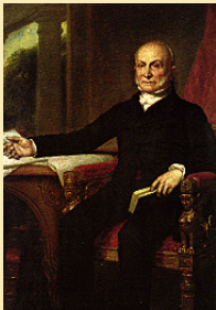
John Quincy Adams 1825-1829

eCards: U.S. Presidents AcroTeX eEducation Bundle