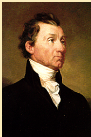
James Monroe 1817-1825

eCards: U.S. Presidents Acro!EX eDucation Bundle