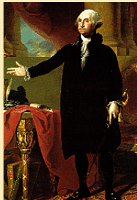
George Washington 1789-1797

eCards: U.S. Presidents Acro!EX eEducation Bundle